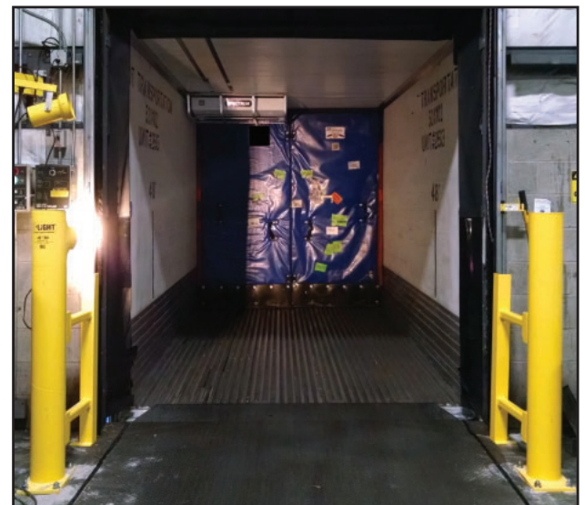
BeLight shown with optional track guard and optional matching bollard with track guard

Call us today to arrange for a free demonstration