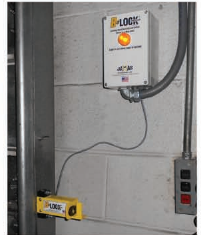
BeLock Controller Locked