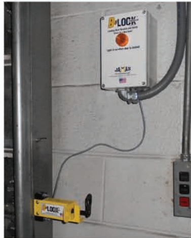
BeLock Controller Unlocked